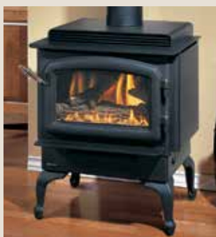
Cast iron legs and black door

Above: F33 shown with optional nickel accent door and nickel legs